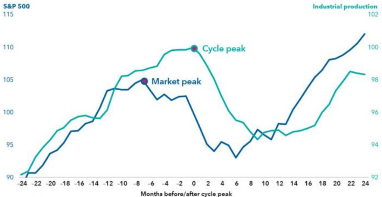
Average S&P 500 Return vs Industrial Production

There is a saying in market research, “analysis of averages leads to average analysis”. It appears many forecasters entering 2023 fell prey to this approach and based on historical recession data proclaimed with great confidence that 2023 was a recession year. However, no such recession has materialized, and the clock is running out in 2023. Our view remains the same as how we entered the year. The likelihood of a recession occurring in the foreseeable future is rising based on a growing body of forward-looking economic data showing the potential for slower future growth.